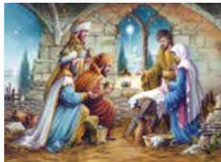
5 Gifts for the New Born King 160 × 116 £3.25