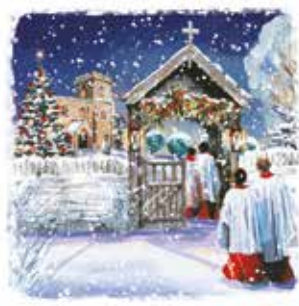
8 Midnight Mass 141 × 141 £2.75