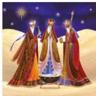
9 Worshipping Kings 140 × 140 £3.25