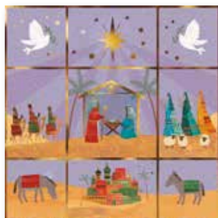
10 The Christmas Story 127 × 127 £3.25