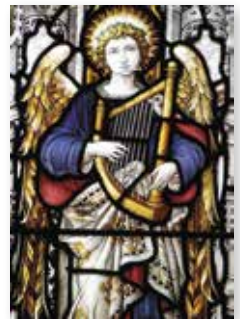
6 Stained Glass Angel 114 × 160 £3.25