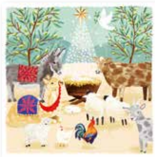
4 Their Master's Crib 127 × 127 £3.25