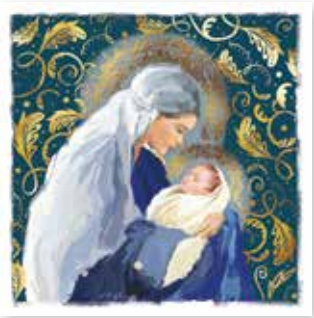
3 A Mothers Love 127 × 127 £3.25