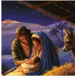
2 In a Stable 127 × 127 £3.25