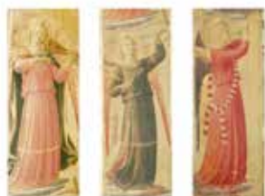
7 Angels 140 × 140 £2.75

All prices refer to packs of 10 cards and include delivery.