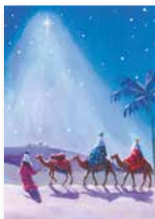
11 Kings and Camels 114 × 160 £3.25