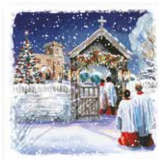
8 Midnight Mass 141 × 141 £3.25