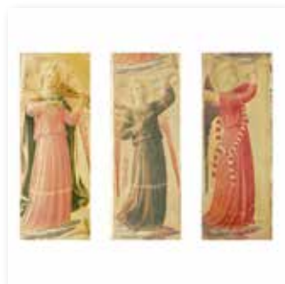
7 Angels 140 × 140 £3.25

All prices refer to packs of 10 cards and include delivery.